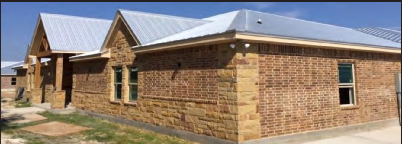
One of three new houses