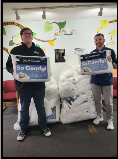
New pillows from Mattressville!

Thank you Seven Points Church of Christ for getting new coats for all of our children!