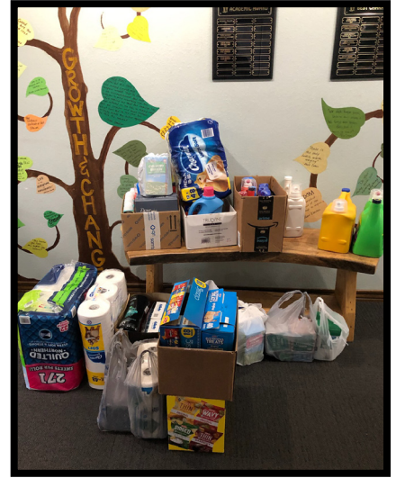
Thank you Huckabay Church of Christ for the commissary items!